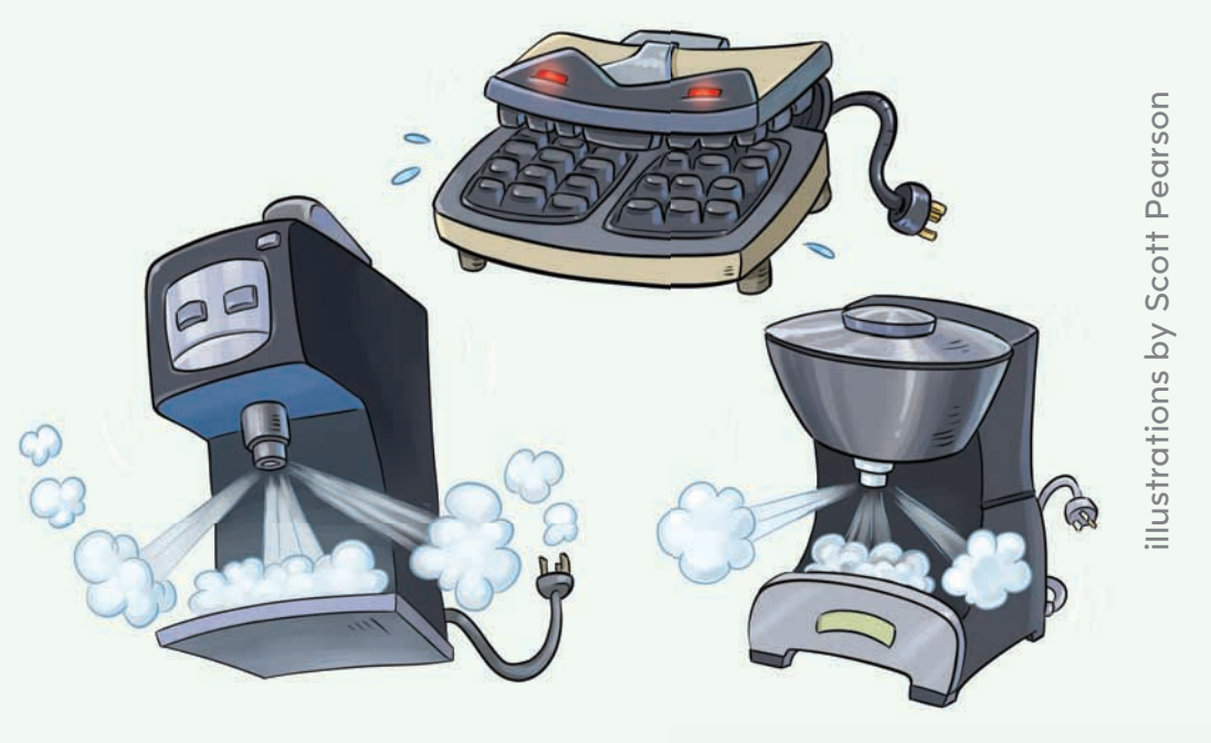
To be continued ...

"Whoa," said the twins at exactly the same time.